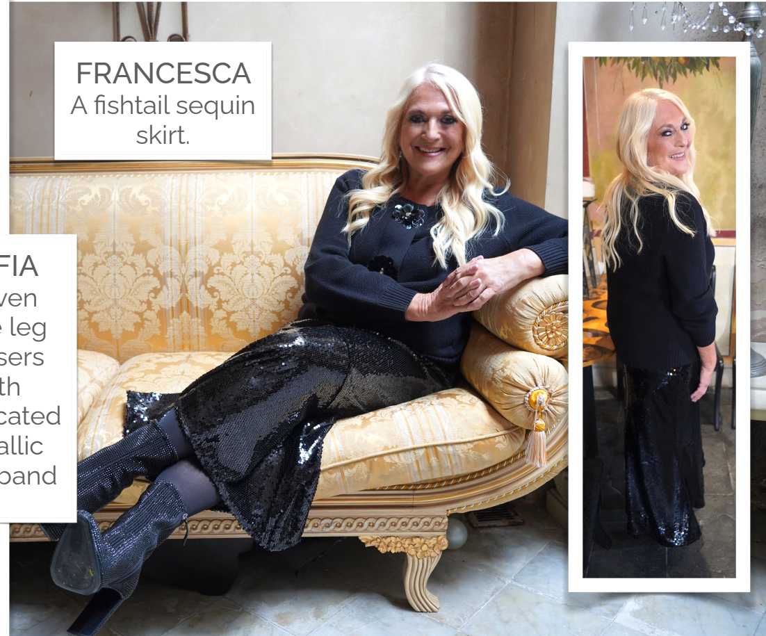
FRANCESCA A fishtail sequin skirt.