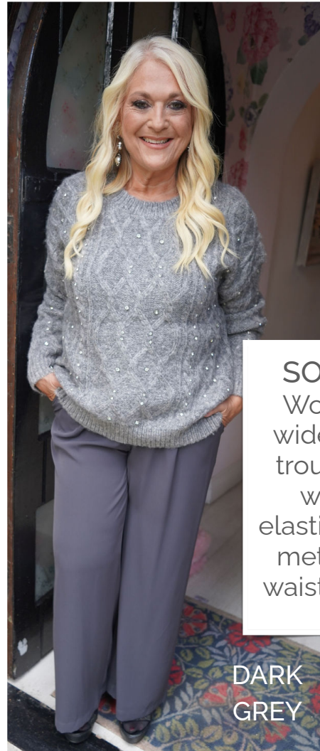
SOFIA Woven wide leg trousers with elasticated metallic waistband

A drawstring jersey trouser adorned with tiny black jet beads.