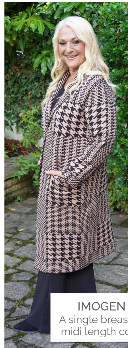
IMOGEN A single breasted midi length coat.