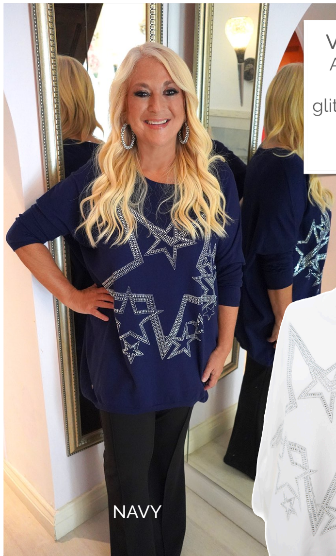
VALERIE A jumper with a glittering star motif