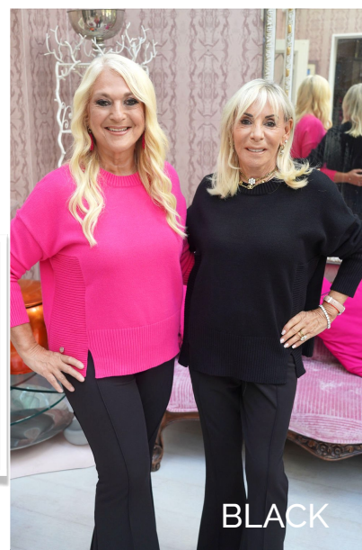
RACHEL Sweater with side slits.