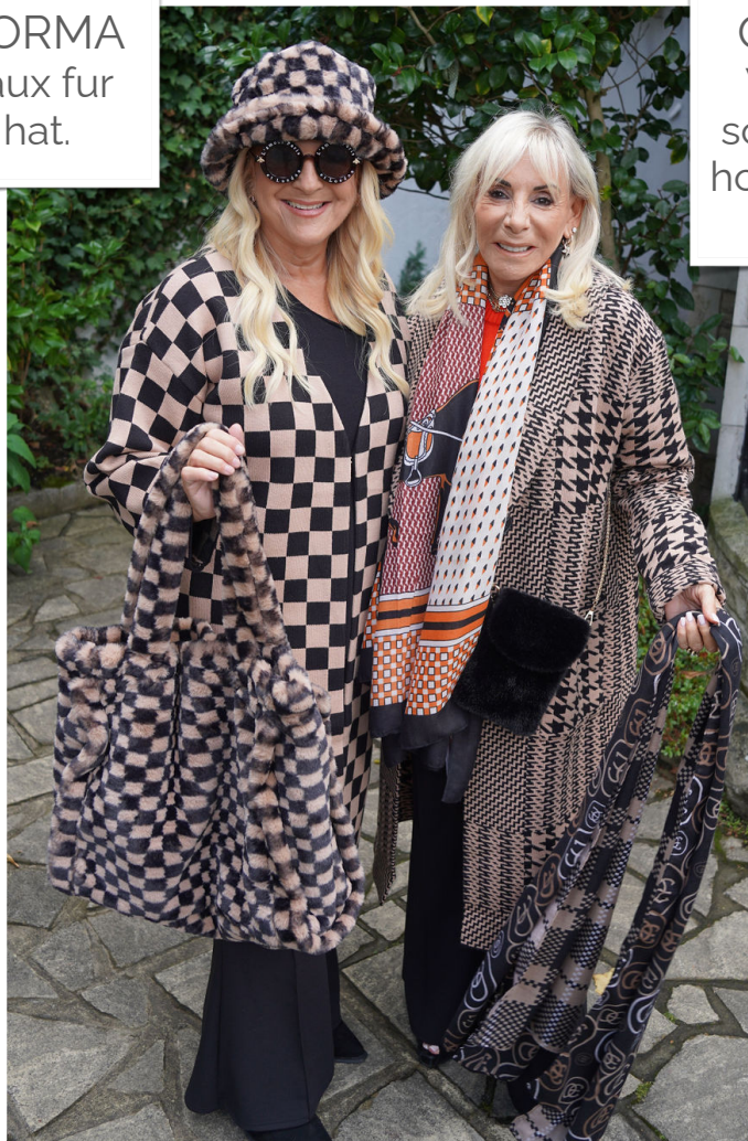
NORMA Faux fur hat.