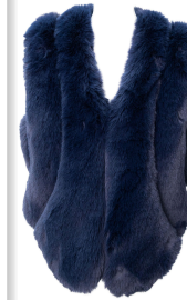
CANDY A sleeveless faux fur hooded gilet.