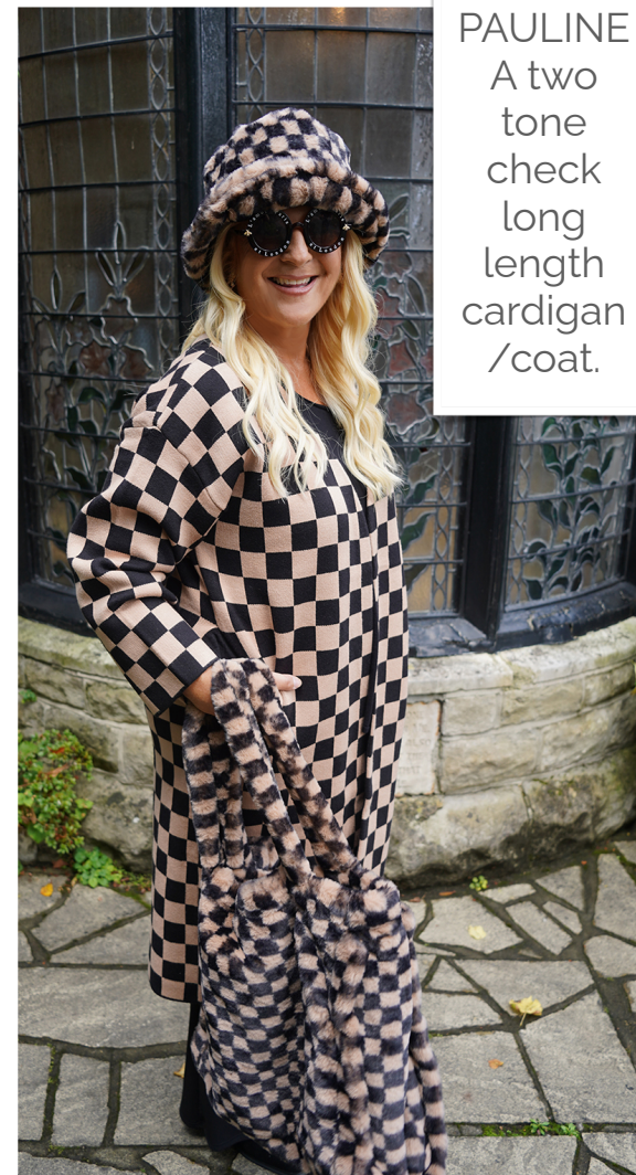
PAULINE A two tone check long length cardigan /coat.