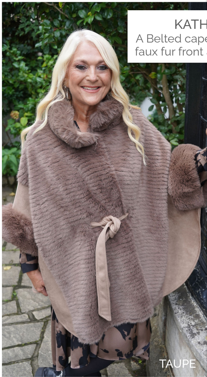
KATHRYN A Belted cape with ribbed faux fur front and tie waist.