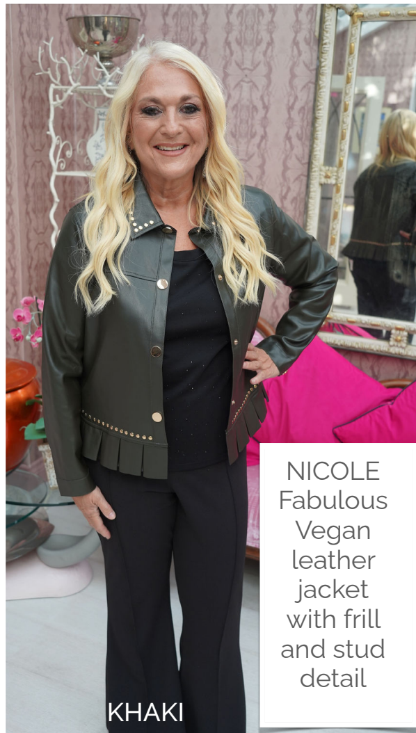
NICOLE Fabulous Vegan leather jacket with frill and stud detail