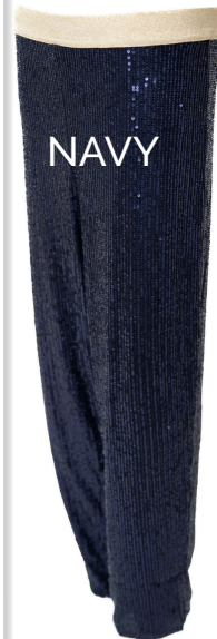
ELLIE A trouser with an all over stud detail