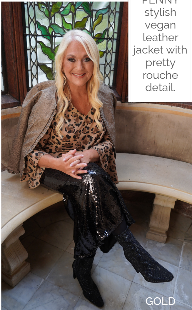
PENNY stylish vegan leather jacket with pretty rouche detail.