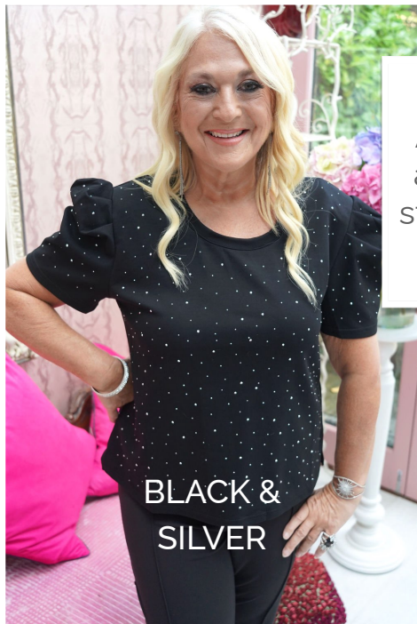
MOLLY A top with an all over stud design.