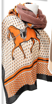
OLIVIA Woven scarf with horse print motif.