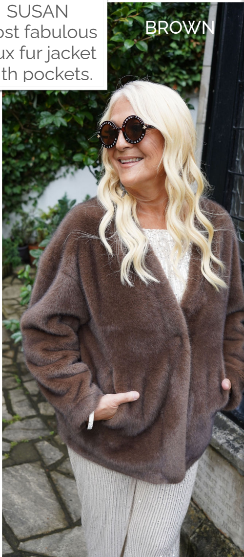
SUSAN Most fabulous faux fur jacket with pockets.