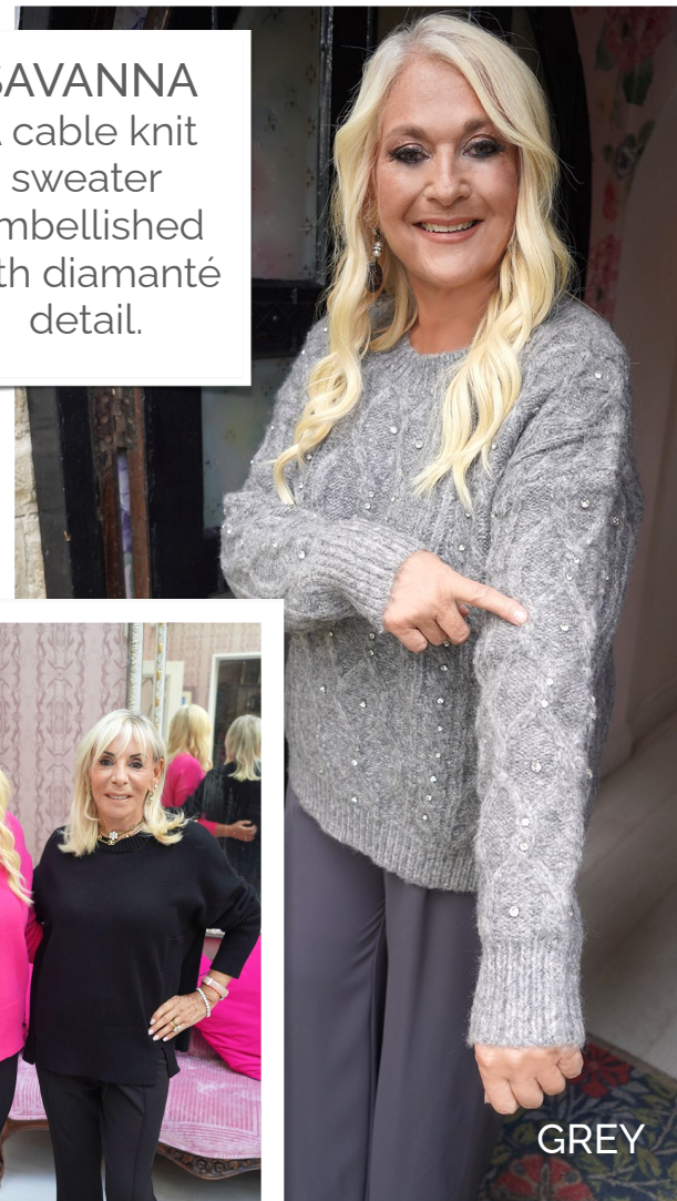
SAVANNA A cable knit sweater embellished with diamanté detail.